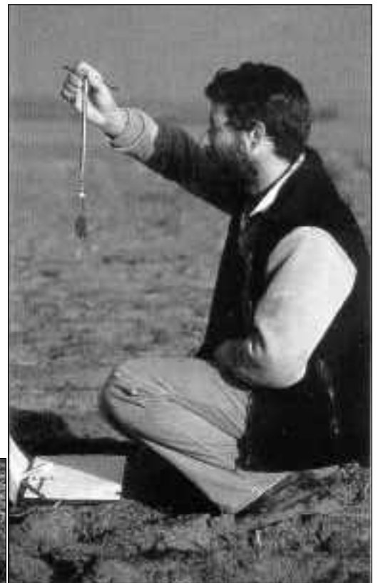
(Above) Measuring mice in the Field. (Left) Mouse Trap in Field use

The Department of Agriculture will assess economic losses to the crop at sowing, at booting, during the week prior to harvest and from yields obtained. Damage to farm machinery and stored grain, plus estimates of the likely risk of soil loss from high winds will also be estimated.