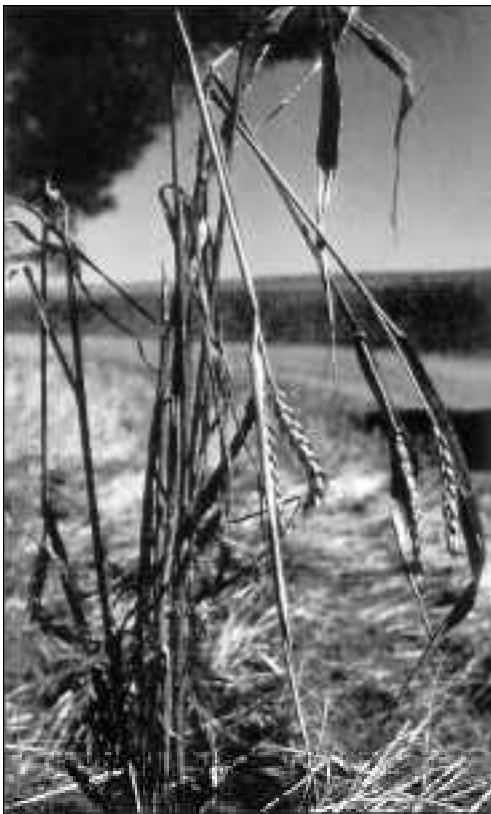
(Above) Wheat damaged by mice. (Right) Mice in a piggery

Mice are capable of transmitting a number of diseases, and cause considerable stress to rural communities. Mice contaminate stored produce which places export and domestic markets at risk. Assessments of the financial impact of mouse plagues do not address adequately the economic and social hardships generated by the stress of sharing one's living space with mice.