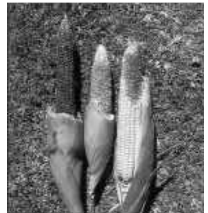
Corn heads damaged by mice

If this is correct, then farm management practices may need to be modified in years when there is a forecast of high mouse numbers.